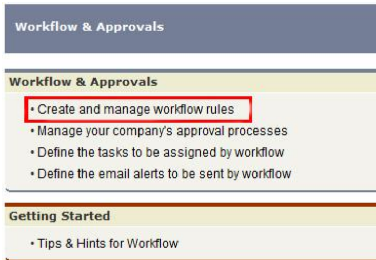
Fig 1.1 – Create and manage workflow rules link.