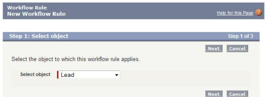
Fig 1.3 – Step1: Select Object type Lead.